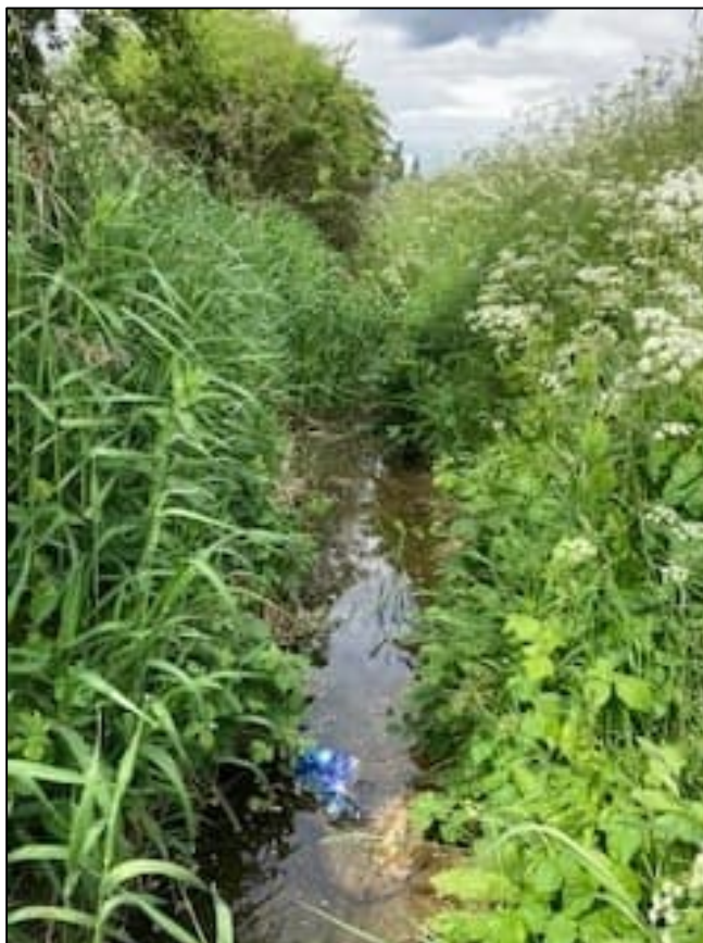
Plate 2. Downstream habitat survey Reach ESN2