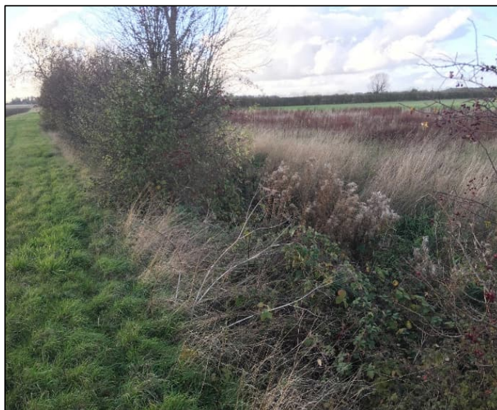
Plate 14. Macrophyte survey Reach FB8 looking downstream

each bank. The silt/clay substrate was submerged by a run of water 1.5 m wide by 15 cm deep on average. Macrophyte taxa identified included fool's watercress and reed canary grass, with an additional cover of less than 0.1% by the filamentous algae aggregate C. glomerata / R. hieroglyphicum .