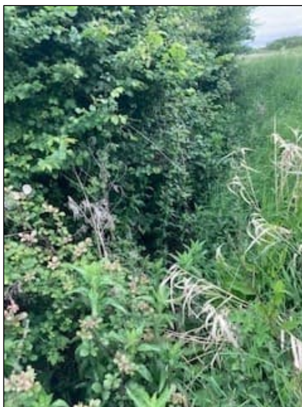
Plate 3. Upstream habitat survey Reach FB4