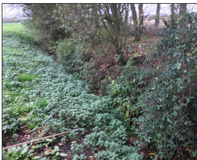
Plate 15. Macrophyte survey Reach ESN12 looking downstream