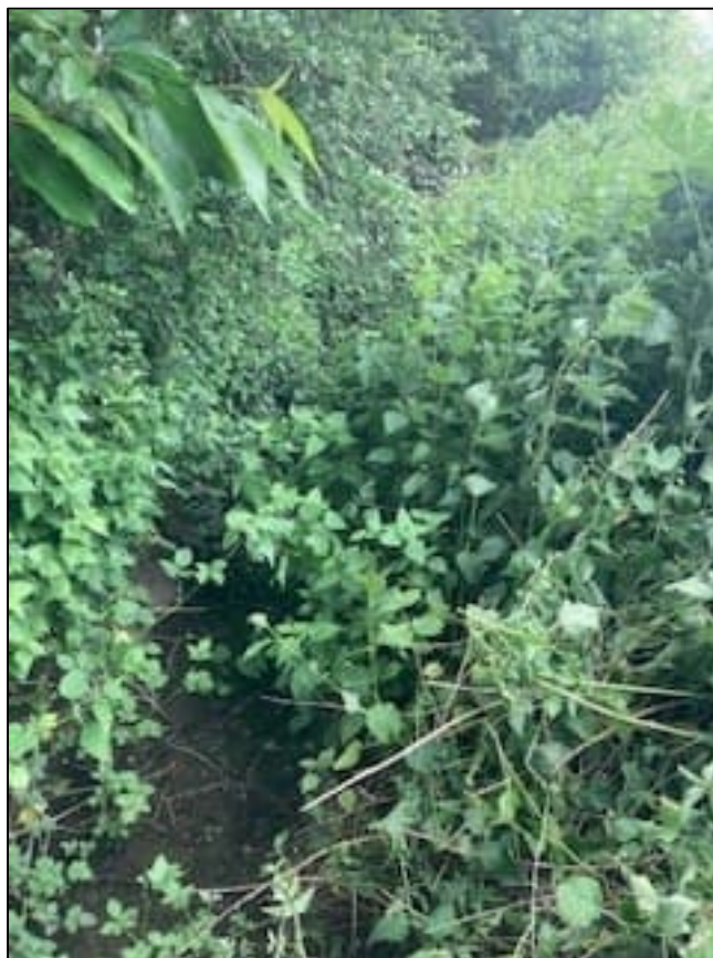
Plate 7. Downstream habitat survey Reach ESN12