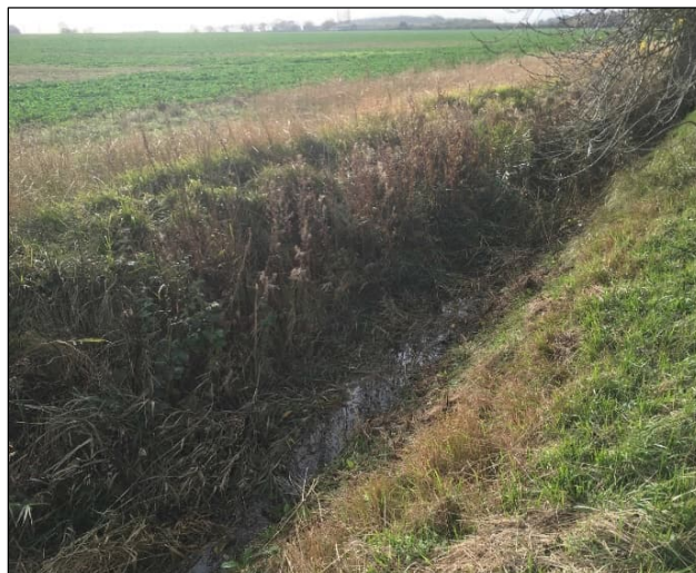
Plate 12. Macrophyte survey Reach FB5 downstream from confluence of two ditches

further 80% from the right bank (Plate 12). The average width of the wetted channel was 75 cm with an average depth of 15 cm. Substrate was entirely silt/clay with run habitat across 70% of the channel and some slack waters. The identified taxon, reed canary grass, covered a total of 20% of the channel with an additional cover of 1% of the algae aggregate blanketweed Cladophora glomerata/Rhizoclonium hieroglyphicum .