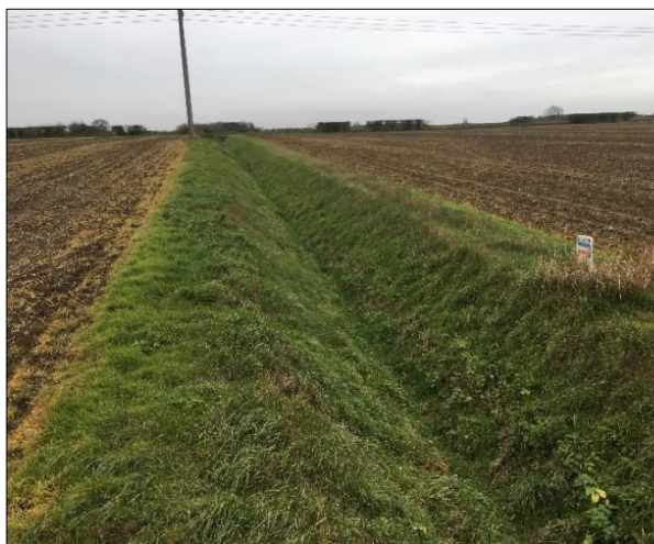
Plate 8. Macrophyte survey Reach at ESN1 looking upstream