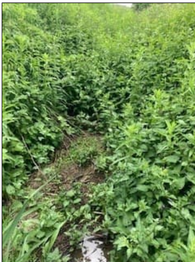
Plate 4. Upstream habitat survey Reach FB5