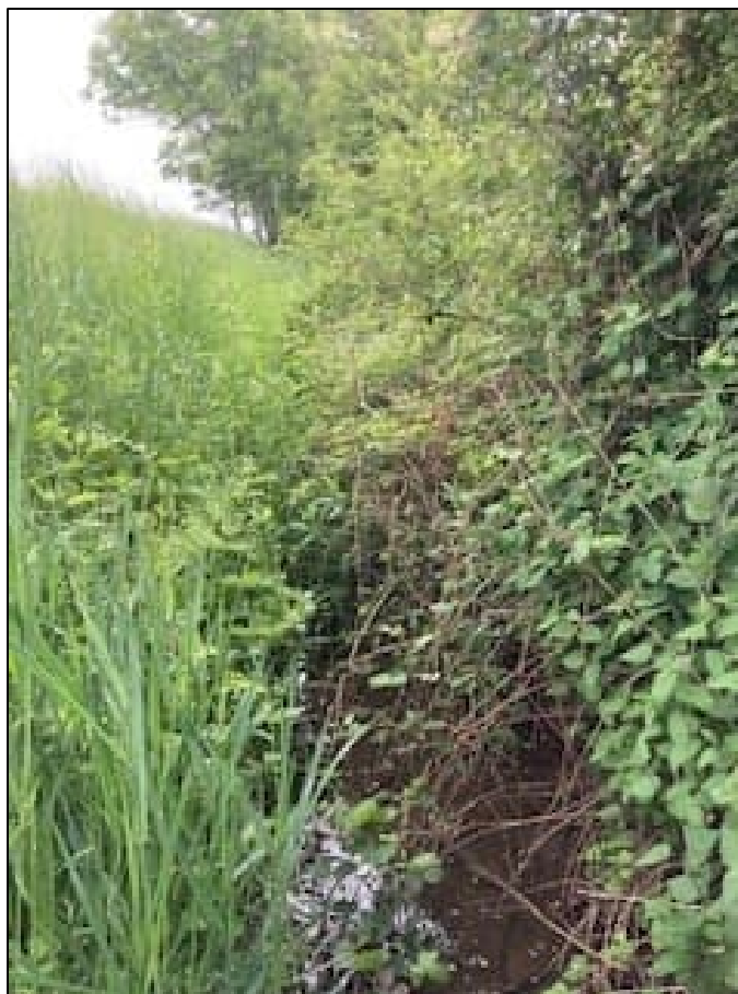
Plate 6. Upstream habitat survey Reach FB8