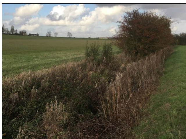
Plate 13. Macrophyte survey Reach FB7 looking upstream