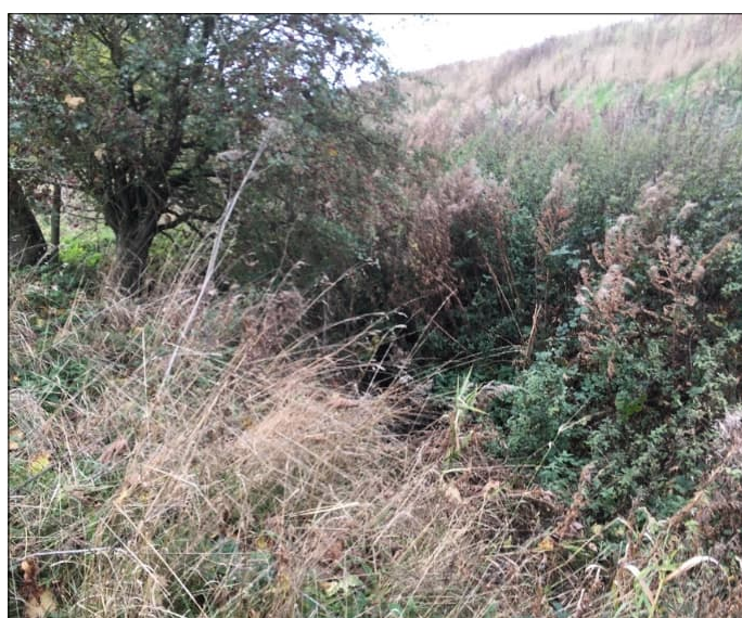
Plate 11. Macrophyte survey Reach FB4 looking downstream towards culvert