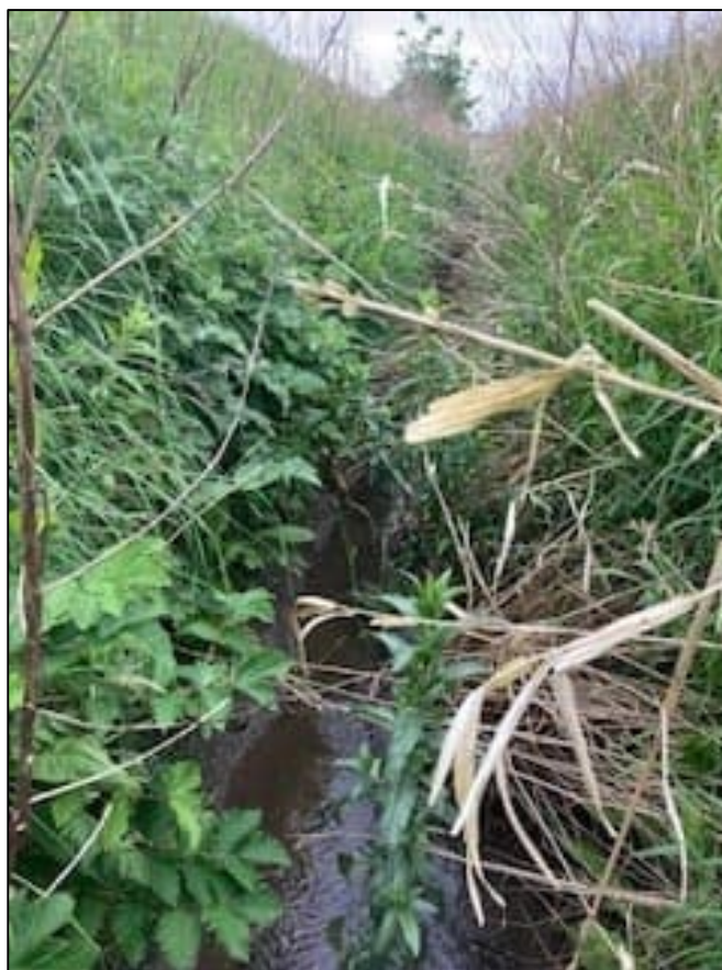
Plate 5. Downstream habitat survey Reach FB7

4.4.26 The surveyed Reach contained sufficient water and aquatic habitats to warrant macroinvertebrate survey at the time of appraisal.