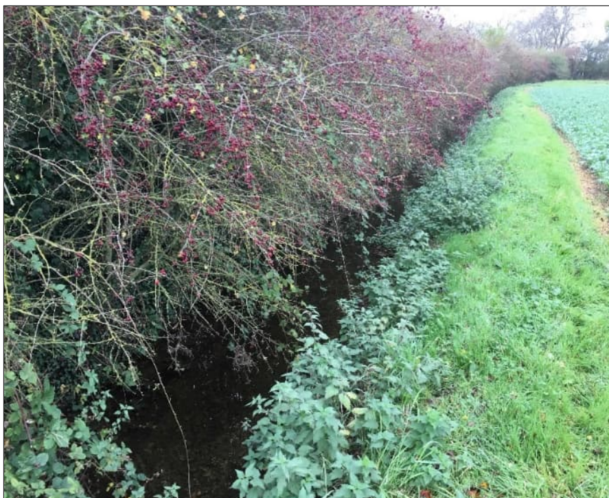
Plate 9. Macrophyte survey Reach ESN2 downstream towards Yawthorpe Beck