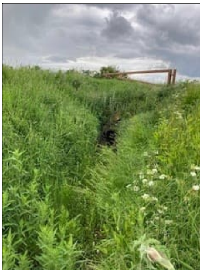
Plate 1. Downstream survey Reach ESN1