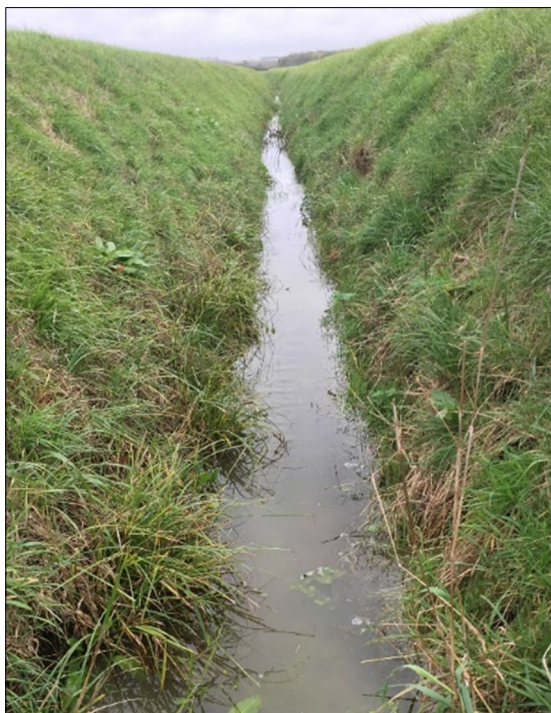
Plate 10. Macrophyte survey Reach ESN3 looking upstream